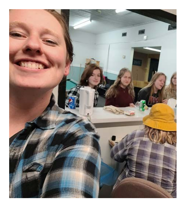
The good 'ol stink eye ranks 3rd in frequent looks I get from the youth.